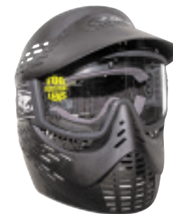
Always wear Paintball Approved Goggles

5. Only play at commercial playing fields that have a chronograph, referees and clearly marked safe fields. Chronograph your marker before each game to ensure your gun is operating at safe velocities. Safe velocities are considered to be below 280 feet per second.