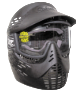
Always wear Paintball Approved Goggles

5. Only play at commercial playing fields that have a chronograph, referees and clearly marked safe fields. Chronograph your marker before each game to ensure your gun is operating at safe velocities. Safe velocities are considered to be below 280 feet per second.